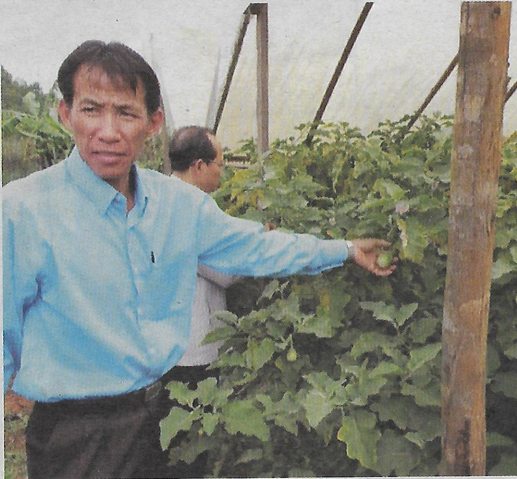
Senior agriculture officials inspect an eggplant crop during a field visit to Champassak province.