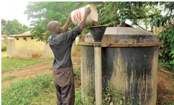
Figure 4. Use of kitchen waste in Uganda (RUDMEC 2013).