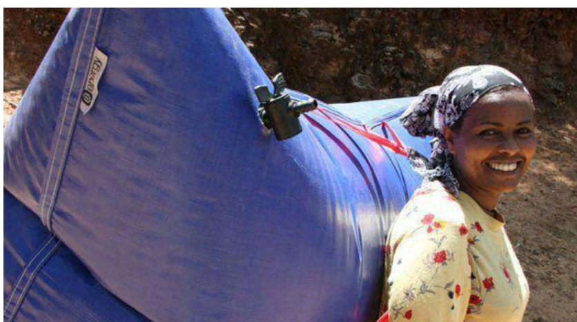
Figure 5. A biogas rucksack in Ethiopia.

pollute the environment. Another benefit of this project is that it will eliminate slaughterhouse-borne diseases that affect public health.