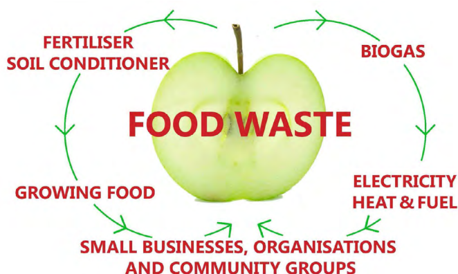
Figure 2. Anaerobic digestion of food waste produces a range of benefits.