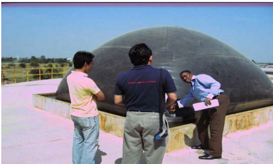
Figure 3. Cows to Kilowatts project in Ibadan, Nigeria.

As examples of the value of this technology, here are three case studies in Africa. The first one is called Cows to Kilowatts, and it is located at Ibadan in Nigeria. The project centres on the construction of a biogas plant and wastewater treatment facility to run on abattoir wastewater, creating a really cheap source of domestic energy. It also abates pollution and is mitigating the production of greenhouse gases. Figure 3 shows part of the biogas facility at the abattoir. This is a community-driven biogas facility using somewhat sophisticated technology called anaerobic fixed-film technology (AFF). It is providing affordable environmentally-friendly safe cooking gas and organic fertiliser, which benefits the urban poor and provides income to farmers. Traditionally, the main fuel for cooking is kerosene, wood or charcoal. They are expensive and labour-intensive and also a very unclean way of cooking. The value proposition of this project is its impact in improving health and producing a digestate that is useful as fertiliser, thereby reducing the use of chemical fertilisers which cost more and