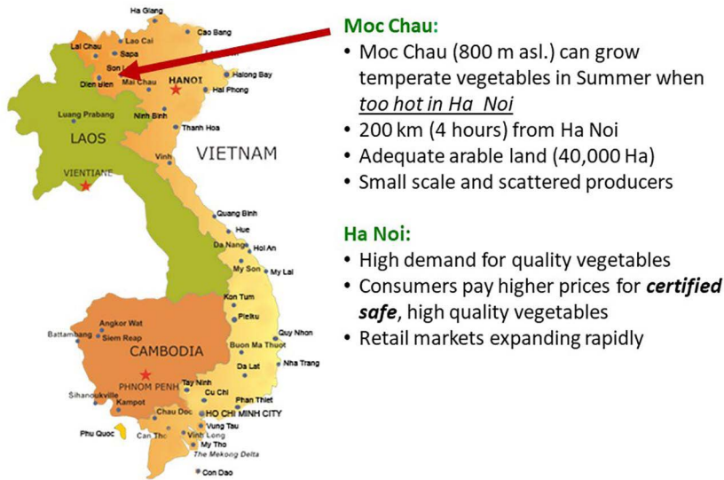
Figure 1: The project area, Moc Chau region in Son La province.

In 2009, from a market study, we realised that there are great opportunities for Moc Chau farmers to improve their income through becoming involved in vegetable supply chains to Ha Noi. This region (Figure 1) has advantageous conditions for temperate vegetable production also in summer (off-season) when Ha Noi and its nearby areas are too hot. Ha Noi consumers are ready to pay higher prices for high quality vegetables, and nowadays the road conditions have been improved and transportation of fresh vegetable from Moc Chau to Ha Noi is relatively easy.