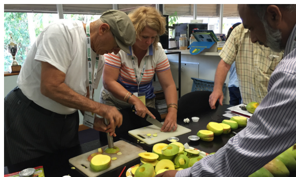
Mango training course participants testing mango dry matter and flower manipulation

Bill Gates, founder of the Bill and Melinda Gates Foundation.